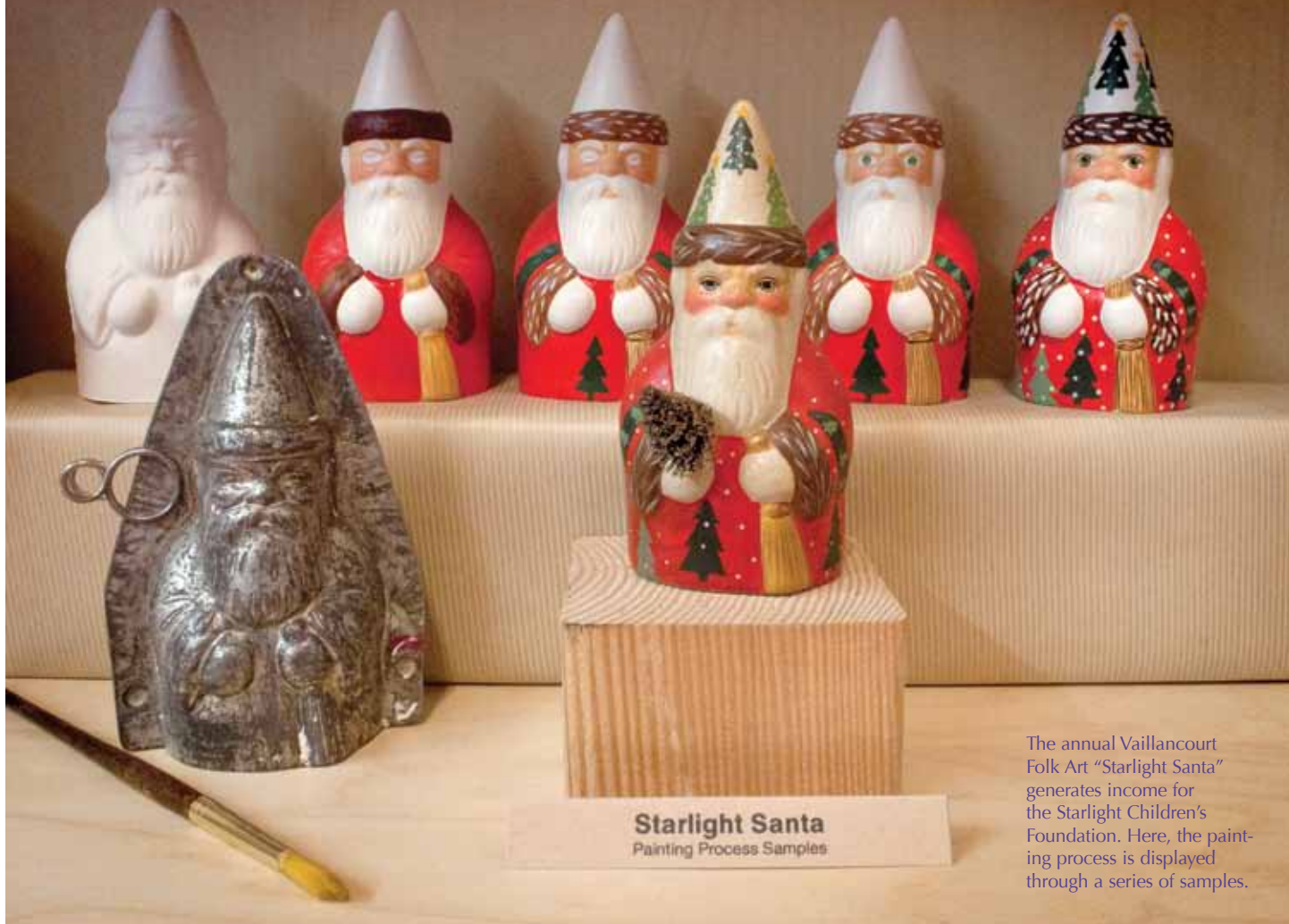
The annual Vaillancourt Folk Art “Starlight Santa” generates income for the Starlight Children’s Foundation. Here, the painting process is displayed through a series of samples.